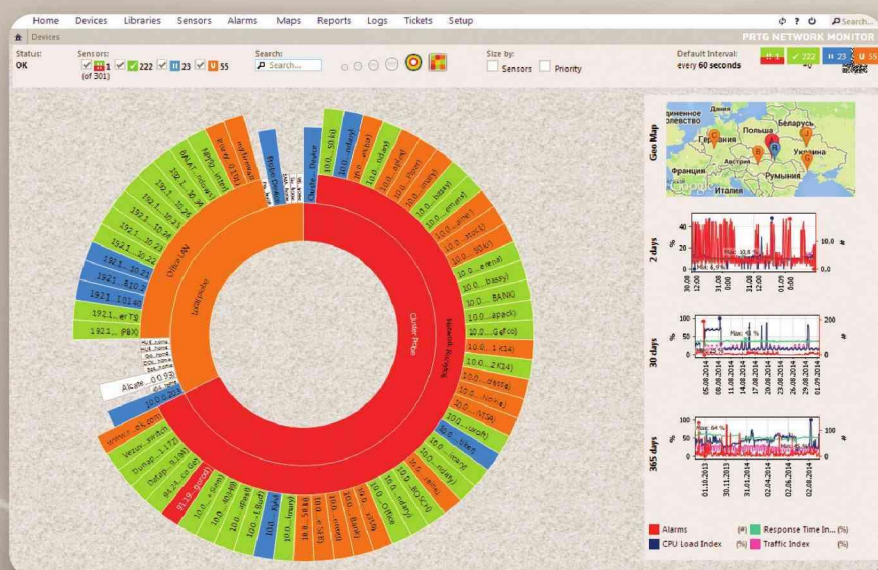
PRTG Sunburst View

With Rozvytok System Integration Services, we apply our experience and expertise to manage your Telecom infrastructure, applications and operations to deliver business improvements while controlling costs.